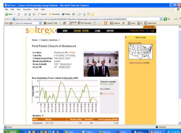
Fig. 3: SolTrex On-line Data Monitoring Display – First Parish Church

All systems are equipped with a SolTrex datalogger, an inexpensive and accurate monitoring device for PV systems developed by CSGS. The datalogger records and transmits data to CSGS network servers, and data is posted on a dedicated website: www.soltrex.com . Through this website, the energy output from the system can be viewed in graphical format (see Figure 3); system specifications and a photo of the system are provided as well. Westwood community members can visit the website and see how their community is off-setting the use of fossil fuels through their systems energy generation. An energy calculator on the website can be used to estimate pollutants avoided from energy generated by PV systems as well.