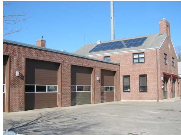
Fig. 1: Westwood Fire Department – 2.64 kW DC(STC) PV System