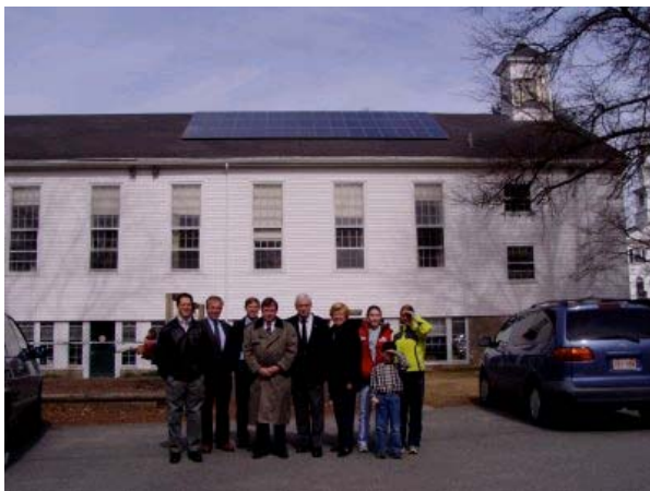
Fig. 5: First Parish Church Members

Westwood town leaders have stated that many people who were never familiar with photovoltaic systems are now more knowledgeable about the technology. Specifically, the town building inspector and wiring inspector became involved in the project and are now familiar with PV. The town selectmen (board of elected officials) have a new understanding of PV and can use this knowledge in planning for the community. Finally, the town is happy to report that the local environmental community is very pleased that their town has taken steps towards a sustainable future. Figure 5 shows a community gathering in front of First Parish Church.