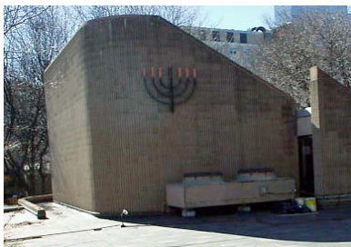
The old air conditioning roof top system, linked to the basement compressor.

The original 30 ton air conditioning system had two units on the roof that provided conditioned air produced by a compressor in the basement. A fan would blow air through