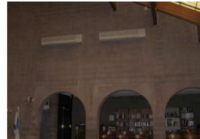
Air Handlers in Sanctuary

There are two air handlers on each side of the sanctuary. (See photo at right). The congregation chose to install them on the sides of the sanctuary because they are close to where people usually sit, but not in a place where they will interfere with the synagogue's interior appearance.