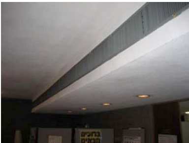
Air Ducts in the Sanctuary

ducts. The treated air was pushed through the air ducts by a large fan system in the basement. (See picture at right.) For many years the system worked reasonably well, but there were problems that burdened the synagogue. The building took a very long time to heat and cool, primarily because both systems needed to travel through the