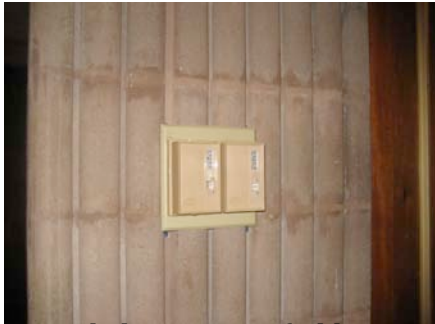
Manual Thermostats of old system

basement and go through large air ducts to reach the sanctuary. Because the synagogue had manual thermostats, the lag-time required that someone be at the facility about an hour ahead of time to turn up the thermostat so that the building would be comfortable for