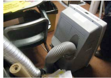
Portable Air Conditioning Unit

Earth's ozone layer. The decision was made not to repair the system. The heat of summer forced the synagogue to purchase makeshift portable air conditioning unit. The portable unit was enough to keep small rooms comfortable, but it was not effective in cooling large areas such as the sanctuary and the social hall.