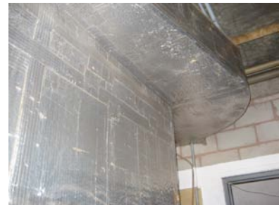
Air Ducts in Basement

Before the changes, the synagogue used steam heat that was imported from Trigen. (See appendix for details on Trigen heating). The synagogue uses no oil or gas. Domestic hot water is heated by electricity. Stoves are electric. The heating system was located in the basement and dispersed heat throughout the building through air