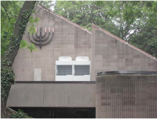
A view from the front of Boston Synagogue with the new Heat Pump

Boston Synagogue (also known as Charles River Park Synagogue) is a small, lay-led synagogue located in the heart of the Old West End near Massachusetts General Hospital. The building was constructed in 1971. It is a single-story structure, with a dramatic pitched “skylight” roof over the Sanctuary. The exterior and much of the interior has architectural block walls. The