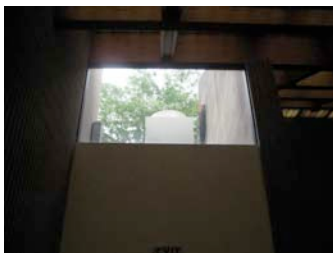
Heat Pump seen from Sanctuary

Based on this advice, and after looking at the North Shore synagogue's system in operation, the Boston Synagogue decided to proceed with the ductless system. It was done in two phases, to conserve funds. In Phase I, the synagogue board approved the installation of a 15-ton heat pump with 10 tons of air handler capacity (4 units at 2.5 tons each). It was believed that this would provide adequate capacity in most circumstances, and that the synagogue could rely on the old Trigen steam system on very cold winter days. Based on how this system worked in practice, the synagogue would consider a future Phase II installation of an additional 5 tons of air handler capacity, representing a 50% increase in HVAC capacity. This would enable the use of the full 15-ton heat pump capacity installed in Phase I, and hopefully reduce substantially the need for supplementary Trigen steam heat.