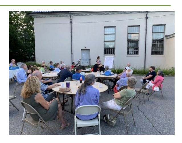
June 29th training in action. Image description: thirty people sit around tables outside, while one person reads from a flipchart.

Since these events, WCCEJ has grown even more, organizing against new gas infrastructure in Worcester and working with MassIPL to co-sponsor the upcoming Love.Earth.Justice event in October!