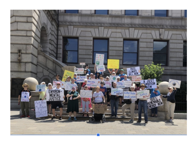
July 11th Eleventh Hour Vigil. Image description: thirty people holding handmade signs stand on the steps of Worcester City Hall.