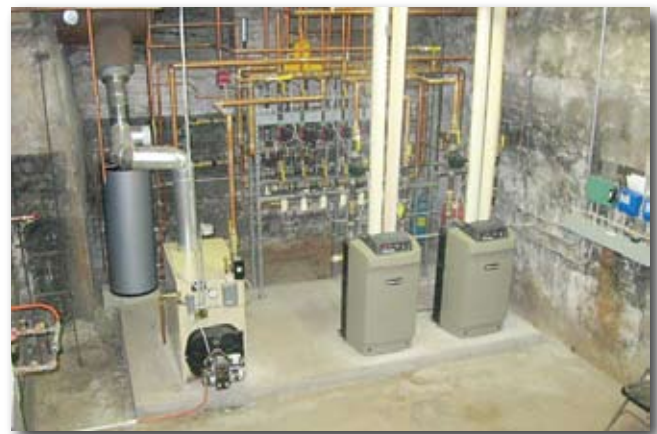
New Boilers at St. James Church.