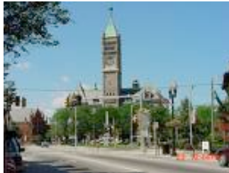
Lowell City Hall 375 Merrimack St. Lowell, Massachusetts