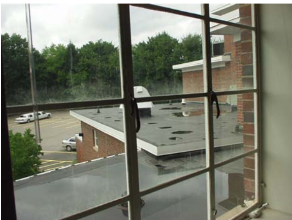
#6 — View through upper level casement window, to roofs, with parking area visible.