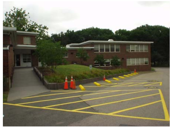
#3 — View of center and east portions of building from rear, with core entry and multi-levelled classroom ring.