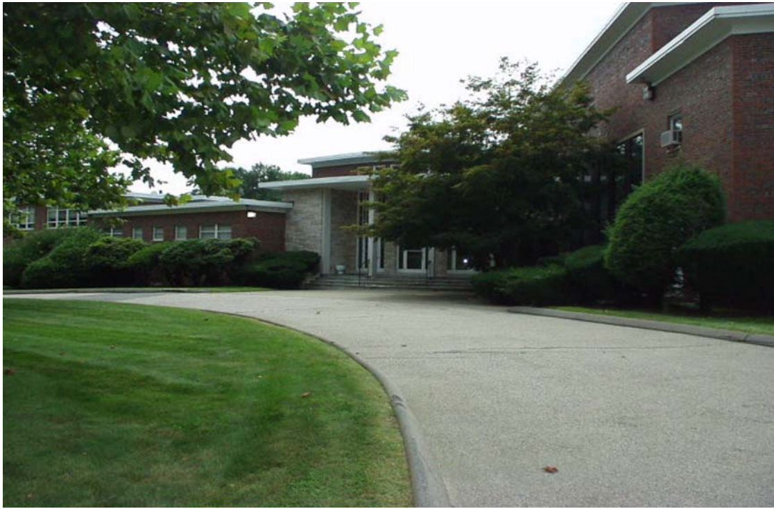
#1 — Beth El Temple Center has three sections: (1) sanctuary and social hall, on right; (2) entry and offices, center; and (3) library, classrooms and offices, on left.