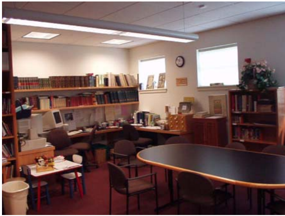
#10 — The library is one of several rooms with fan coil units for space conditioning.