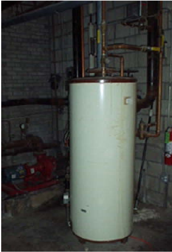
#20 — Domestic hot water tank is gas-fired. Note circulating pumps at left rear. Some newer circulating pumps have been installed.