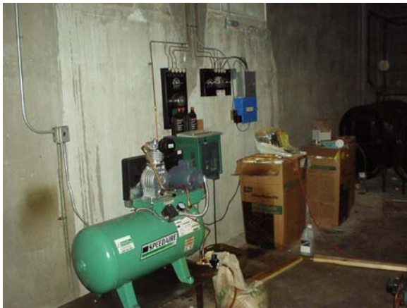
#21 — Original building controls are pneumatic. Replace with digital.