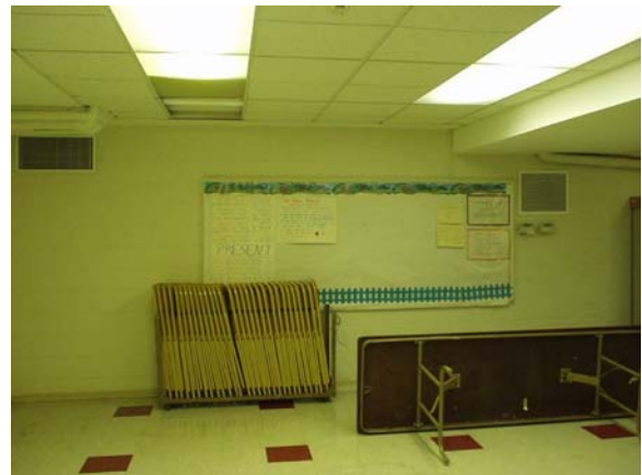
#14 — The meeting room in the basement has space conditioning via a fan coil unit (FCU) located in the space behind this wall, with conditioned air delivered via the wall diffuser. It also has a cabinet FCU, on the opposite wall.