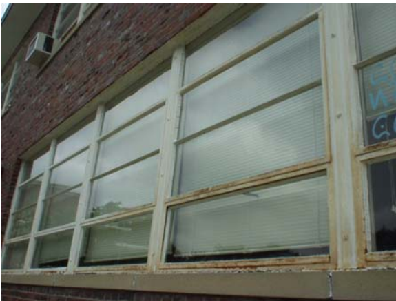
#5 — The original metal frame single pane windows are nearing end of useful life. They present energy efficiency challenges, especially when window ACs are added.