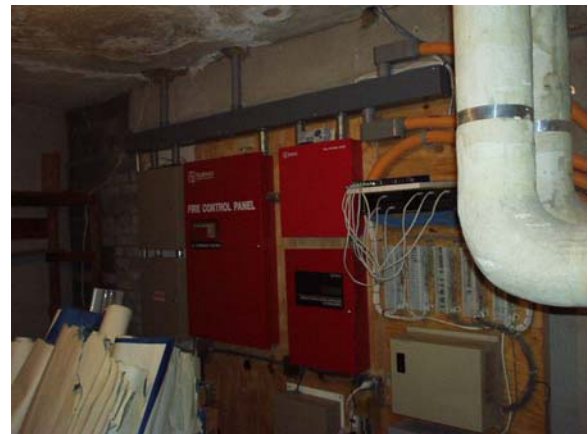
#23 — Fire controls are in basement. Monitor regularly to ensure proper operation.