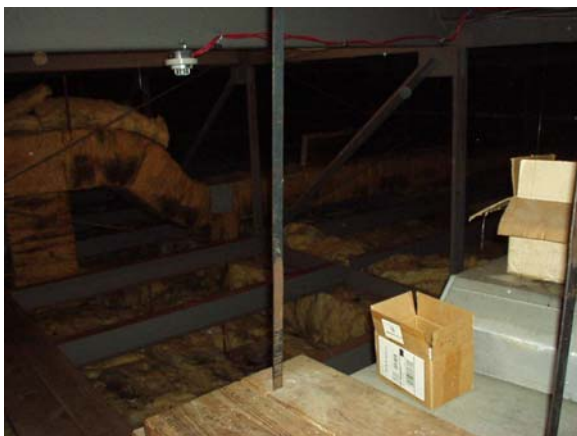
#16 — Attic space over sanctuary, with batt insulation above ceiling, also wrapping ducts.