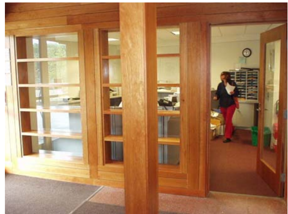
#8 — Administrative office is immediately inside rear entry door.