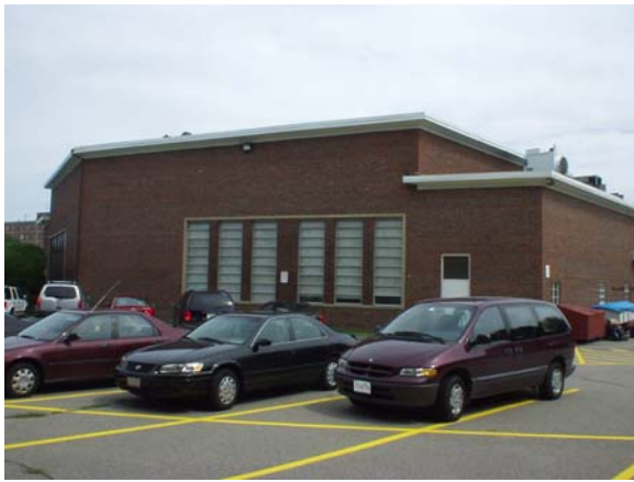
#2 — View of west portion of building from rear, with social hall in foreground.