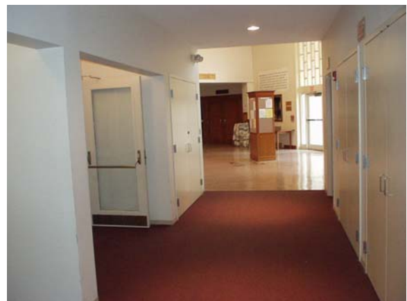
#9 — Large lobby connects sanctuary/social hall area to classroom and office spaces.