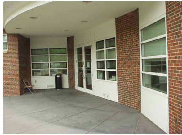
#7 — Rear door is main entry for most purposes.