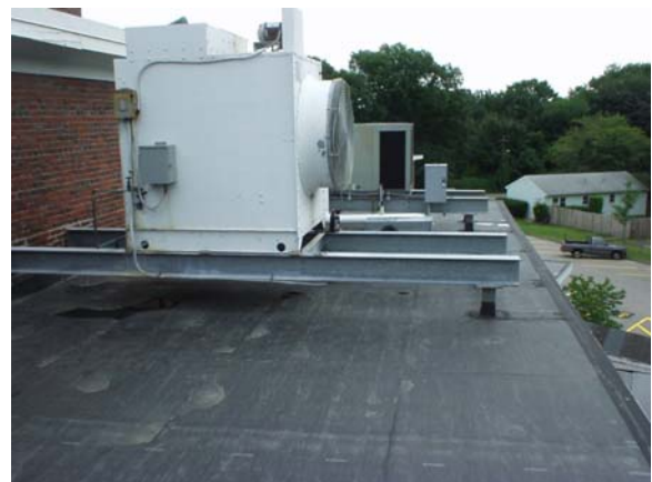
#19 — The roof over the rear of the social hall is the location of the cooling tower (foreground) and one of the newer condensers. A new condenser was installed at the same time, serving the kitchen.