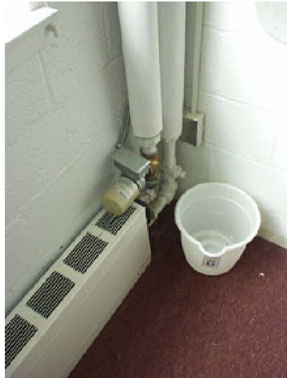
#13 — Detail of radiator and controls in classroom wing.