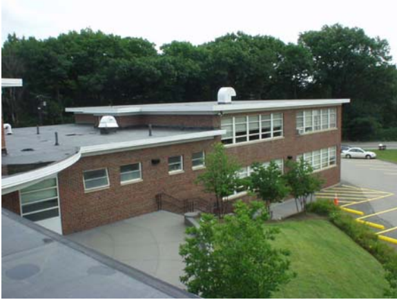
#4 — The building has rubber membrane roofs.