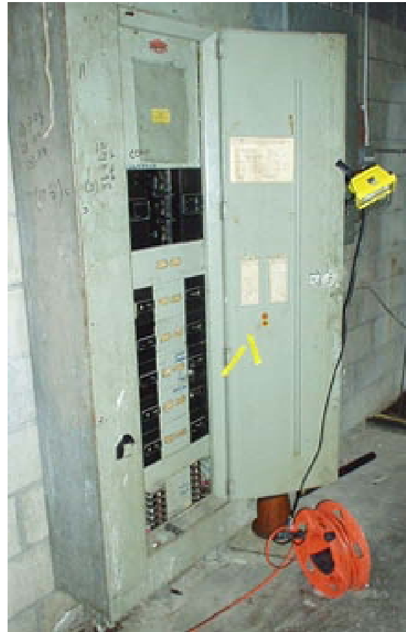
#22 — Electric service dates to building construction. Upgrades for new HVAC and contemporary uses of electricity likely.