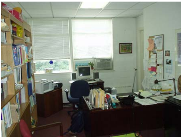
#11 — The offices and classrooms have baseboard hydronic heating.