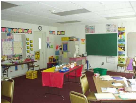
#12 — Classroom wing has suspended tile ceilings with florescent lighting.