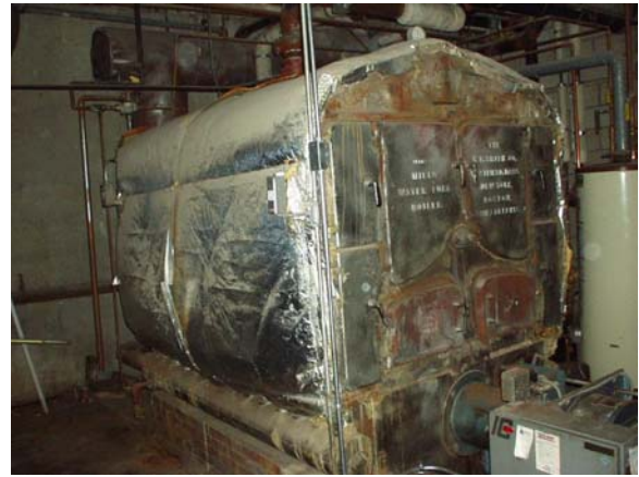
#17 — Oil-fired boiler dates to construction of the building, in the 1950s. It is beyond its useful life.