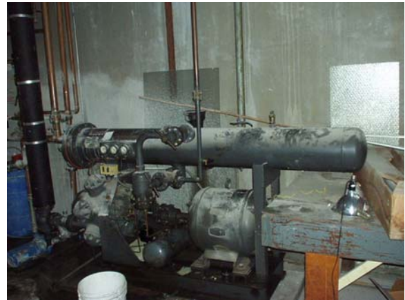
#18 — Chiller is basement also dates to the construction of the building, and is beyond its useful life.