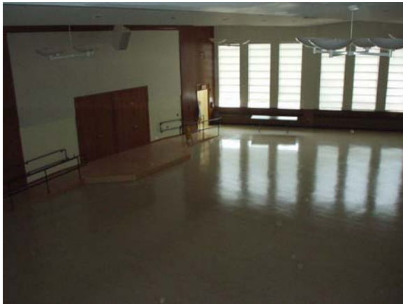
#15 — Social hall connects to sanctuary, with a folding door able to separate the two spaces. This space is also conditioned by attic mounted fan coil units.